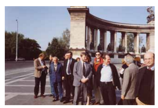
Study group in Budapest 1992. Colleagues from Eastern Europe and the EC meet.

not only because of IACAPAP members meeting with East European colleagues, but also by Eastern colleagues meeting and discussing with each other, something they had had little chance to do until then, coming as they did from countries as wide apart as Latvia in the north and Albania in the south. Their common language was Russian. Thus, this ISG was part of the important process of developing new lines of communication with and bringing Eastern European colleagues and their national societies into contact with IACA-PAP. Two years later, at the world congress in San Francisco in 1994, a large group of Eastern European colleagues participated with financial help from a French sponsor. Later, at a meeting of the European Society of Child and Adolescent Psychiatry (ESCAP) in Utrecht, the Soros Foundation assisted another group from Eastern Europe to make it possible for them to attend. And at the IACAPAP congress in Stockholm in 1998