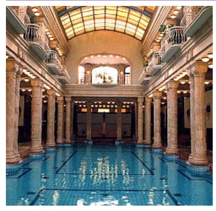
Floating in style. The main pool at the Gelert spa.

Gisela Sugranyes, one of the fellows, was the special reporter and co-editor of this section.